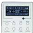
THERMOSTAT MC20700140 (XK46)